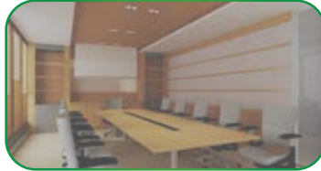
Minimum Brightness Presenting