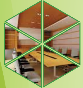
Smart-Zone Conference Room