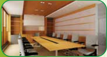
Warm White Calm