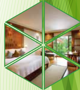
Smart-Zone Hotel Room