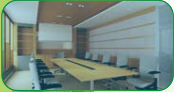
Neutral White Comfortable