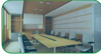
Half Brightness Opening