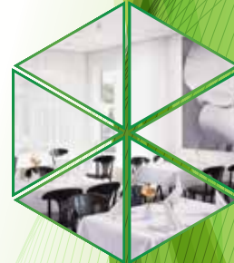
Smart-DIM I Restaurant

"Greener. Smarter." That's our slogan and our mission. With LEDbay's eco-friendly, high power-efficacy, and long lifespan LED products, customers enjoy great energy savings as well as ease of maintenance in the long run. In addition, with our smart "lighting on demand" systems, you get full control of your lighting system and your electricity bills.